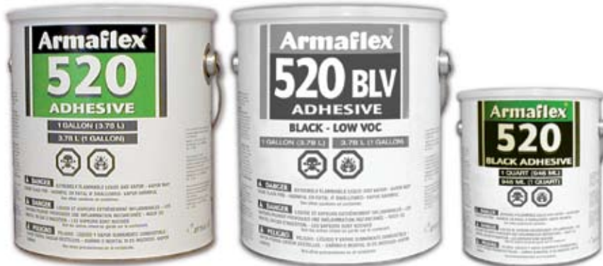
Armaflex 520, 520 BLV & 520 Back Adhesives Air-drying contact adhesives that are excellent for joining Tubolit seams and butt joints.